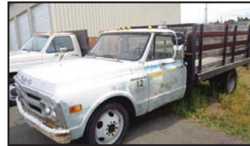
FORD F350 TILT BED