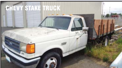
CHEVY STAKE TRUCK

Gas Detector; Fire Hydrants Fire Box; Fire Finder; Fire Hose 6 In. Fire Hose & Diffuser