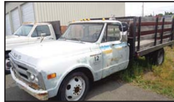
FORD F350 TILT BED