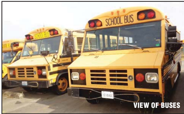
VIEW OF BUSES

1400 N.E. 16TH AVE., OAK HARBOR, WHIDBEY ISLAND